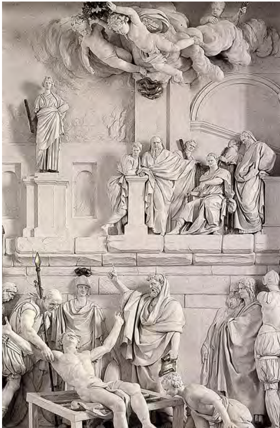
Giacomo Serpotta (1656-1732), The torment of San Lorenzo