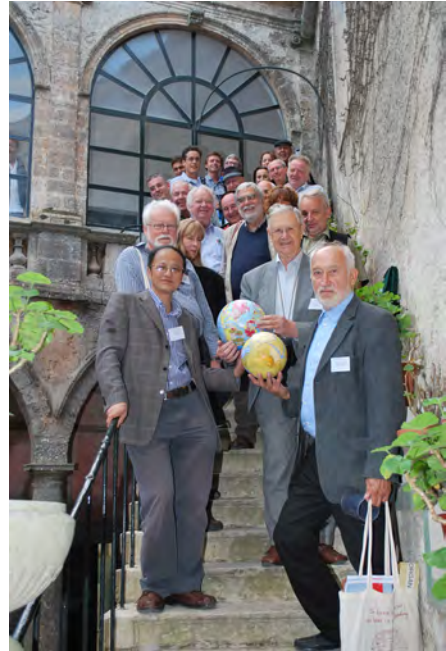
Fig. 3. Participants in the 37th School of Geophysics lined up along the famous stairs in the internal courtyard of the San Rocco building. The globes belong to the collection of Klaus Vogel.

"GEOLOGIC AND GEOPHYSICAL EVIDENCE" supporting the Earth expansion theory are provided in this part, using both regional and global argu-