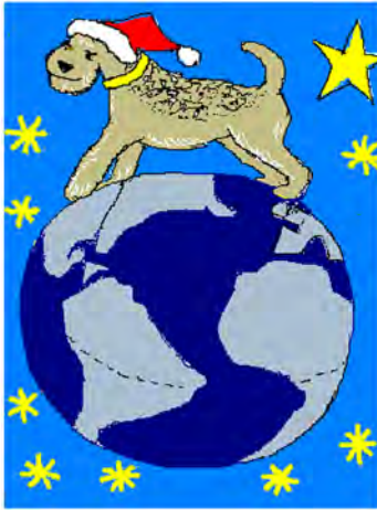
Fig. 4. Greetings for a happy and prosperous New Year from Helge Hilgenberg.

tried to convert into musical chords the periods of revolution of the inner and outer planets. May be that these chords were used to generate more complex musical compositions, but up to the present time his scores must be considered as lost. If his scores still exist, we hope for a future possible recovering of them.